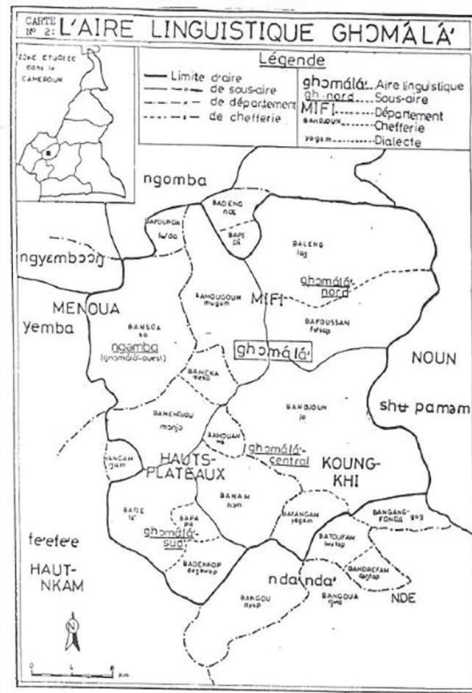
The Ghomálá' linguistic area