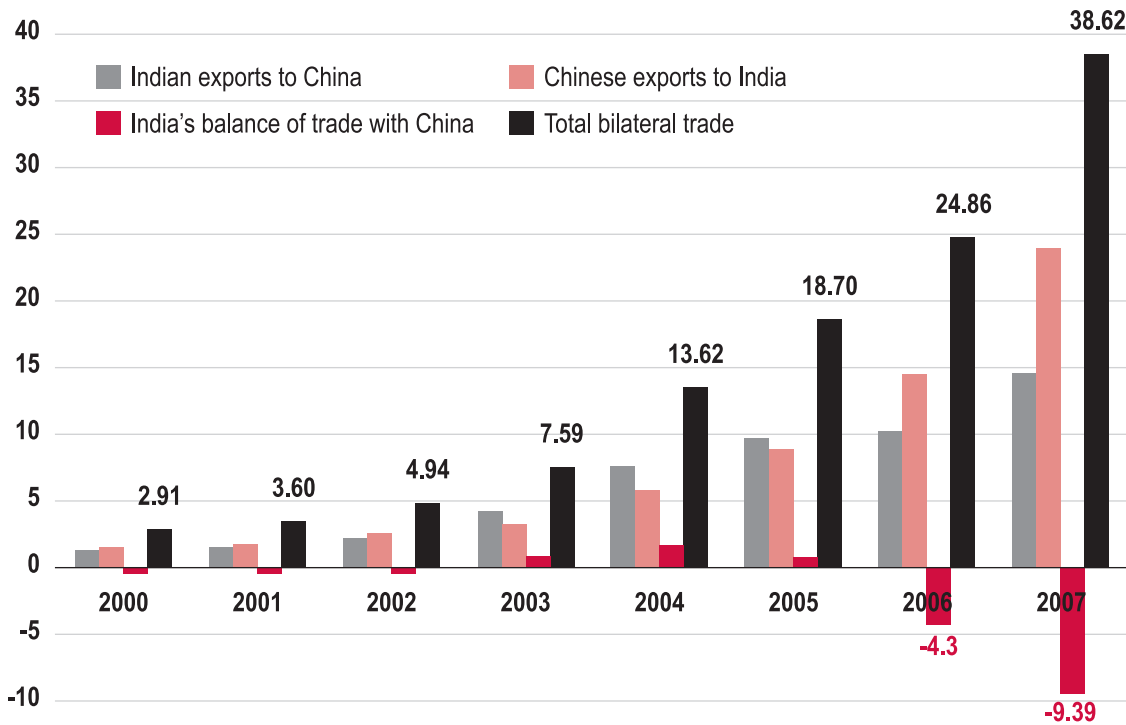
Graph 2. Evolution of India-China bilateral trade (in billions of $)