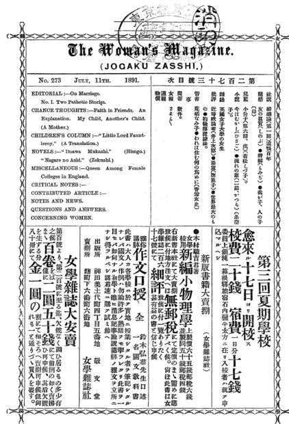
English and Japanese contents of Jogaku zasshi 273, Meiji 24 (1891), July 11. ( Jogaku zasshi , 16 volume facsimile. Rinsen Shoten, 1984.)

The first girl belongs to a wealthy upper-class family from the country. Confined to her home, her only friend is Jogaku zasshi , thanks to which “she creates an image of the ideal gentleman and the ideal lady ( risō no shinshi , risō no kajin o omoi 理想の紳士、理想の佳人を思ひ)” and “soon discovers the reasons for the coldness between the members of the Japanese family (“ Nihon no kazoku no reireitaru yuen o satori ” 「日本の家族」