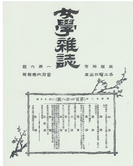
An example of the elegant cover of the magazine Jogaku zasshi 148, Meiji 22 (1889), February 9. ( Jogaku zasshi , 16 volume facsimile. Rinsen Shoten, 1984.)

Jogaku zasshi was targeted at several groups of readers: well educated women and young girls who were both fascinated by the female characters presented in the literary texts and keen to keep a modern home; progressive men, educators and friends of the editors; and certain younger women, mission-school students, who were interested in reading the essays on social reforms, women’s rights and education. 10 This tension between practical advice for a wide audience and reflections for an elite group is interesting in its linking of political debate (strengthening the Japanese nation, women’s emancipation) and scientific reflections (health, psychology) within an educational project (the education of women) that was firmly focused on everyday life (saucepans). 11 Although not specific to the journal, the tension which seems to reflect a somewhat positivist attitude, must have been difficult to resolve. In 1892, after conducting a survey of his female readers, Iwamoto decided to split the journal