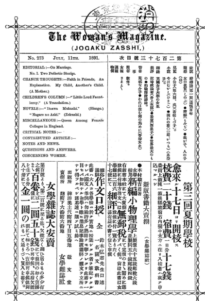
English and Japanese contents of Jogaku zasshi 273, Meiji 24 (1891), July 11. ( Jogaku zasshi , 16 volume facsimile. Rinsen Shoten, 1984.)

The first girl belongs to a wealthy upper-class family from the country. Confined to her home, her only friend is Jogaku zasshi , thanks to which “she creates an image of the ideal gentleman and the ideal lady ( risō no shinshi , risō no kajiin o omoi 理想の紳士、理想の佳人を思ひ)” and “soon discovers the reasons for the coldness between the members of the Japanese family (“ Nihon no kazoku no reireitaru yuen o satori ” 日本家族