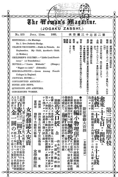
English and Japanese contents of Jogaku zasshi 273, Meiji 24 (1891), July 11. ( Jogaku zasshi , 16 volume facsimile. Rinsen Shoten, 1984.)

The first girl belongs to a wealthy upper-class family from the country. Confined to her home, her only friend is Jogaku zasshi , thanks to which “she creates an image of the ideal gentleman and the ideal lady ( risō no shinshi , risō no kajin o omoi 理想の紳士、理想の佳人を思ひ)” and “soon discovers the reasons for the coldness between the members of the Japanese family (“ Nihon no kazoku no reireitaru yuen o satori ” 「日本の家族」