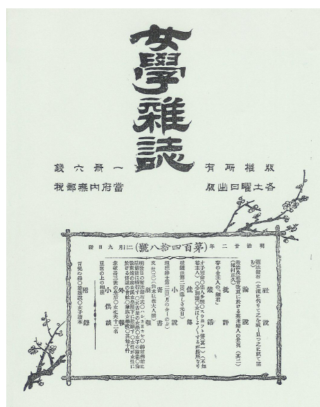
An example of the elegant cover of the magazine Jogaku zasshi 148, Meiji 22 (1889), February 9. ( Jogaku zasshi , 16 volume facsimile. Rinsen Shoten, 1984.)

Jogaku zasshi was targeted at several groups of readers: well educated women and young girls who were both fascinated by the female characters presented in the literary texts and keen to keep a modern home; progressive men, educators and friends of the editors; and certain younger women, mission-school students, who were interested in reading the essays on social reforms, women’s rights and education. 10 This tension between practical advice for a wide audience and reflections for an elite group is interesting in its linking of political debate (strengthening the Japanese nation, women’s emancipation) and scientific reflections (health, psychology) within an educational project (the education of women) that was firmly focused on everyday life (saucepans). 11 Although not specific to the journal, the tension which seems to reflect a somewhat positivist attitude, must have been difficult to resolve. In 1892, after conducting a survey of his female readers, Iwamoto decided to split the journal