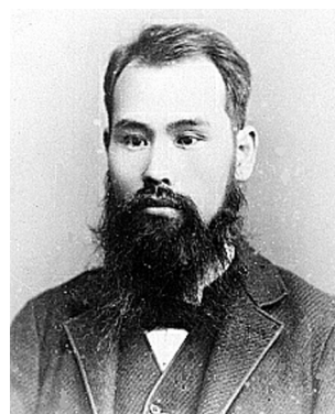
Iwamoto Yoshiharu (1863–1942).

The widely ranging subject matter covered by the journal seems to stem from the encyclopedic energy and ambition of its editor. Iwamoto Yoshiharu was one of those men with extraordinary backgrounds and incredible vigor who made the Japan of the Meiji period (1868–1912). 14 The adopted son of a samurai from Tajima province (in present day Hyōgo prefecture), he was trained in the Chinese classics, without becoming an eminent specialist in the field. After studying under Nakamura Masanao 中村正直 (1832–1891) and graduating from his school (Dōjinsha 同人社) in 1880, he attended the agricultural college (Gakunōsha 学農社) of another important Christian of the time, Tsuda Sen 津田仙 (1837–1908), graduating in 1884. Iwamoto was then baptized in 1885 by Kimura Kumaji 木村熊二 (1845–1927), who had recently returned to Japan from the United States. 15